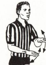
CHAIR MOVEMENT VIOLATION