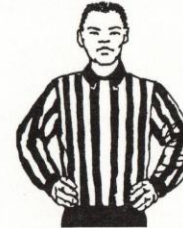
CENTER LINE SHOT VIOLATION/ILLEGAL GOAL