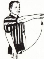
GOAL AREA VIOLATION