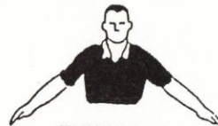
UNSPORTMAN LIKE CONDUCT