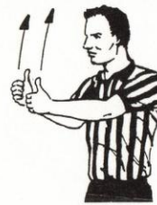
TWO SECOND TIE-UP